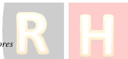
Figure 1. Differences in high and low scores